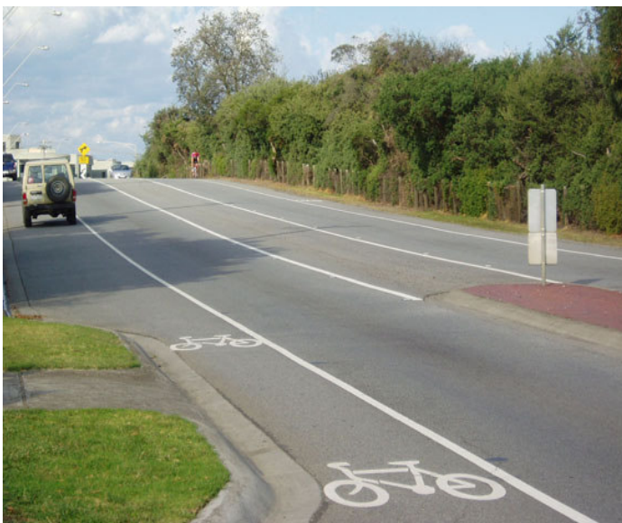
Part of the Safety Section of Beach Road, between Cliff Grove and Wells Road

www.beaumarisconservation.net/m8_bicyc.htm