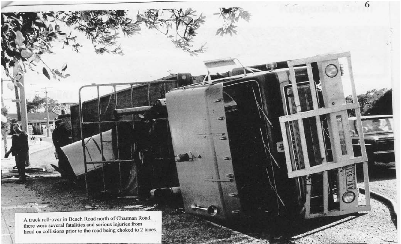
A truck roll-over in Beach Road north of Charman Road. there were several fatalities and serious injuries from head on collisions prior to the road being choked to 2 lanes.

- Note the quickly patched successive bounce gouges in the bitumen road surface, like one of the Dam Busters' bouncing bombs!